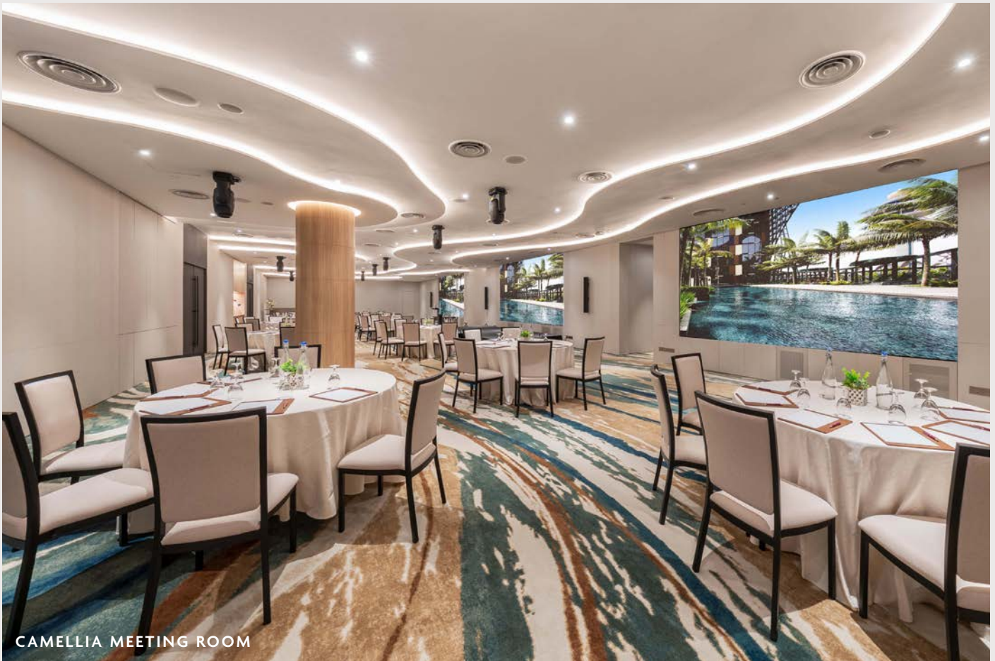
CAMELLIA MEETING ROOM